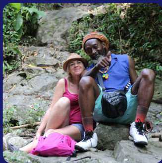
The Witch + The Werewolf