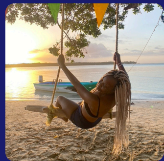
Sand Play + Freedom